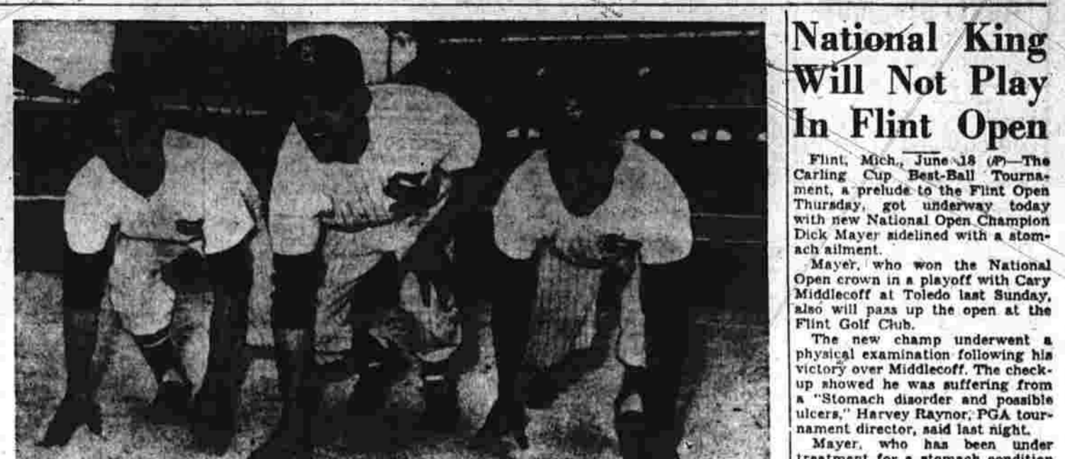
The Chicago White Sox are setting a new pace in the American League, leading the league in batting average. The White Sox have a batting average of .330 and have hit .400 in their last 10 games.